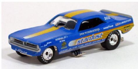
Funny Car Legends— Release 1 Don Schumacher