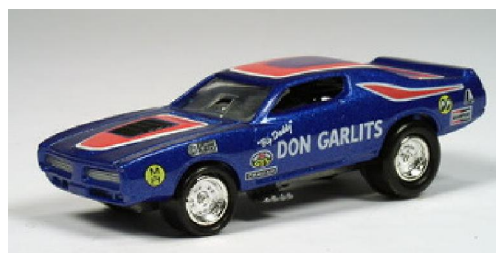
Dragsters USA 2 Series 2 Don Garlits